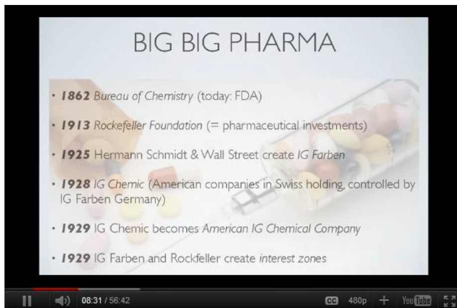
Caption: Some slides from Desiree Rover's presentation

Now let's watch David Rockefeller whose grandfathers were the key architects of modern Western medicine, express his grave concerns for overpopulation.